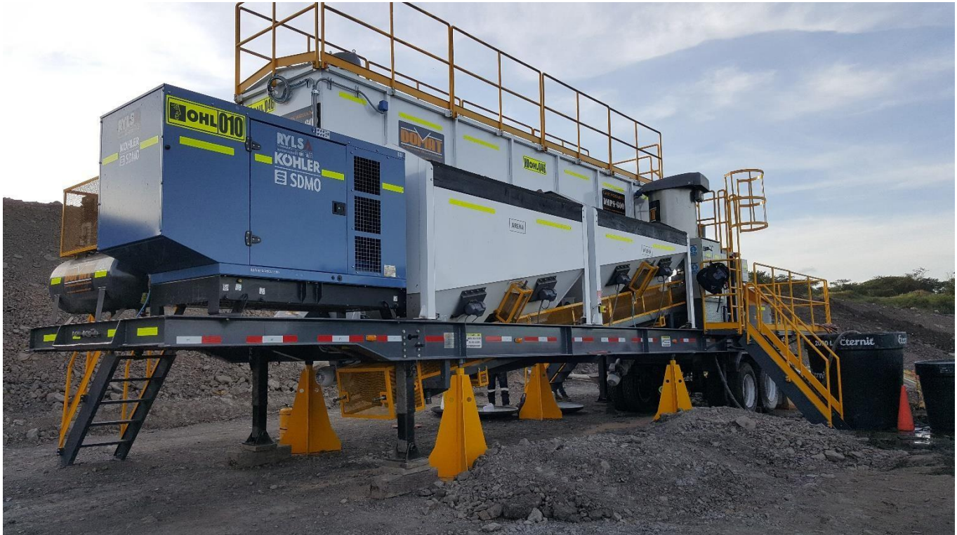
DOMAT DMPS 35 concrete batching and mixing plant

DOMAT DMPS 35 concrete batching and mixing plant.