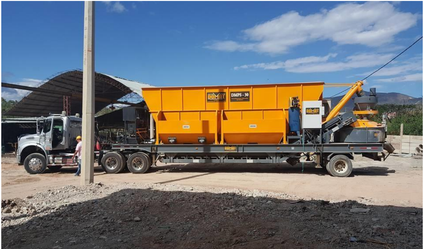
DOMAT DMPS 35 concrete batching and mixing plant

Compact mobile plant that integrates aggregate storage and transportation systems, cement silo and screw conveyor, mixer, and even electric generator on the same chassis, governed by robust dosing and mixing software conditioned in an operating cabin. Domat's DMPS series integrates the equipment necessary for the technical production of concrete on a semi-trailer assembly to be easily transported and installed with a minimum of civil works in the project.