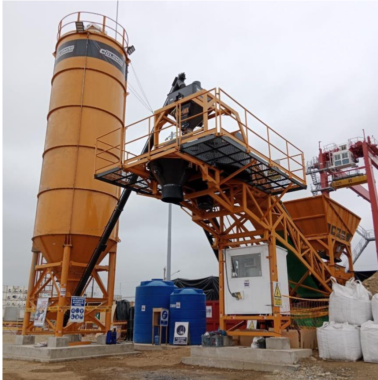
DOMAT DMA 50 concrete batching and mixing plant

DOMAT DMA 50 concrete batching and mixing plant.