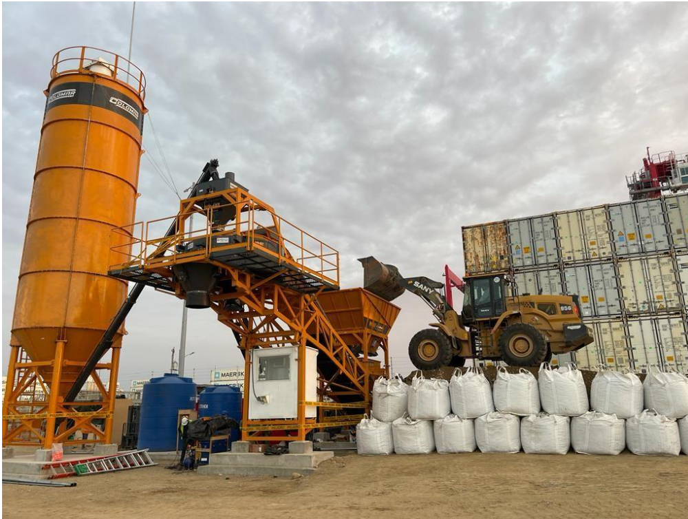
DOMAT DMA 50 concrete batching and mixing plant

Plant designed for the dosage and technical mixing of materials in concrete production with direct discharge at height, allowing the implementation of different transport systems for the premixed concept, equipment equipped with DOMAT turbo-type vertical axis mixers with production capacity of up to 52.3~65.4 yd 3 /hour. Domat's DMA series integrates an innovative design that facilitates the discharge of concrete directly to the stationary pump or to a mixing truck, minimizing the investment in civil works required for this type of operation.