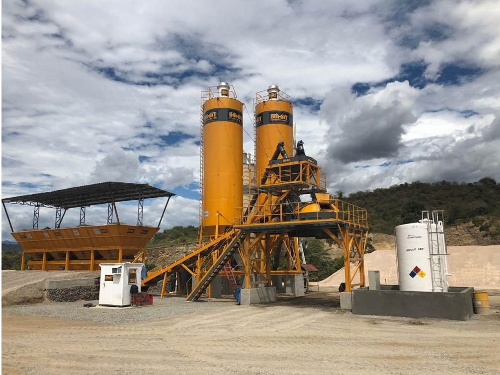
DOMAT DMPE 80-4A concrete batching and mixing plant.